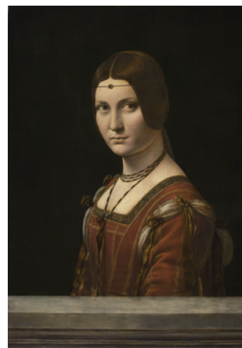
Leonardo da Vinci Portrait of a Woman, incorrectly known as La Belle Ferronnière c. 1490-1497, oil on panel, 63 x 45 cm, Musée du Louvre, Paris

This exhibition highlights essential characteristics of Renaissance art, which flourished in Italy and elsewhere in Europe during the 15th and 16th centuries, through more than 50 masterpieces of paintings, sculptures, prints, and decorative arts selected from the collection of the Louvre. Featured works by Renaissance masters include Leonardo da Vinci's Portrait of a Woman , known as La Belle Ferronnière , making its first appearance in Japan.