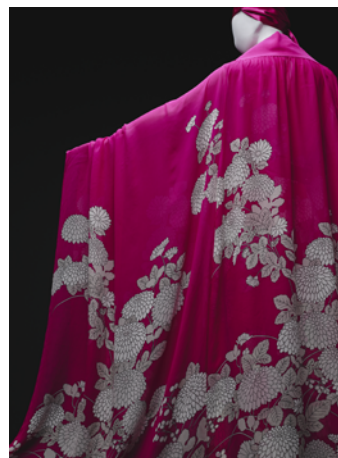
Hanae Mori, Evening ensemble (jumpsuit, caftan) "Chrysanthemum Pajama Dress," 1966 HANAE MORI, Iwami Art Museum

Hanae Mori began her career in the 1950s, first gaining recognition for her work in film costume design. As a designer who was also a wife and mother, she represented a new image of womanhood in postwar Japan. She later unveiled her work in New York and Paris, consistently showcasing the beauty and refinement of Japanese textiles and craftsmanship while conveying both artistic vision and technical mastery. This exhibition surveys the full scope of Mori's long career through approximately 400 works.