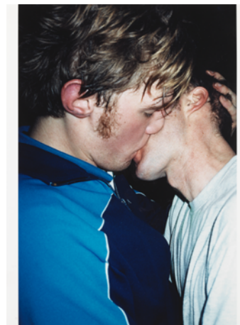
Wolfgang Tillmans, The Cock (kiss), 2002

This exhibition explores the dynamic evolution of British art from the late 1980s to the early 2000s. After going through the Thatcher era (1979–1990), a charged and uncertain social climate gave rise to a new generation of artists who challenged traditional norms and embraced bold, experimental practices. Many of the newer generation of artists who came to prominence in the 1990s were referred to in the art and popular media under the title Young British Artists (YBAs). Alongside other artists active at the time, these artists explored themes such as popular culture, personal identity, and shifting social structures. They worked across a diverse range of media, including painting, sculpture, photography, video, and installation. Featuring around 100 works by approximately 60 artists, the exhibition traces the radical creativity and groundbreaking approaches that redefined British art in the 1990s.