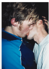
YBA&BEYOND: British Art in the 90s from the Tate Collection February 11 (Wed) — May 11 (Mon), 2026

Director General / The National Art Center, Tokyo