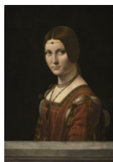
Masterpieces of the Renaissance from the Musée du Louvre September 9 (Wed) — December 13 (Sun), 2026

Leonardo da Vinci Portrait of a Woman, incorrectly known as La Belle Ferronnière c. 1490–1497, oil on panel, 63 x 45 cm, Musée du Louvre, Paris